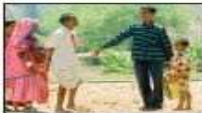
A youngster leaves for Pune.

was sending him off said, "Two of my sons migrated to Pune. It is easy to find work there."